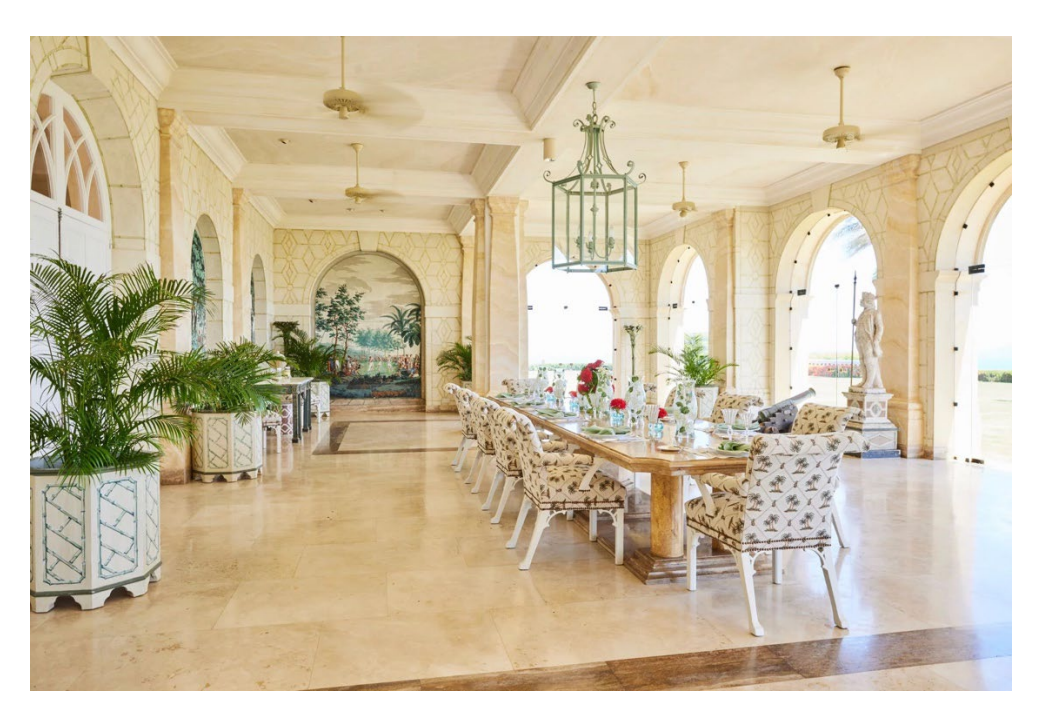
The Mustique Company

In true Mustique style, The Terraces isn't just a villa, it's practically a palace – especially as it also comes with a team of 18 staff (including two butlers, three chefs and six housekeepers). It's no wonder this magnificent island is a celebrity hotspot.