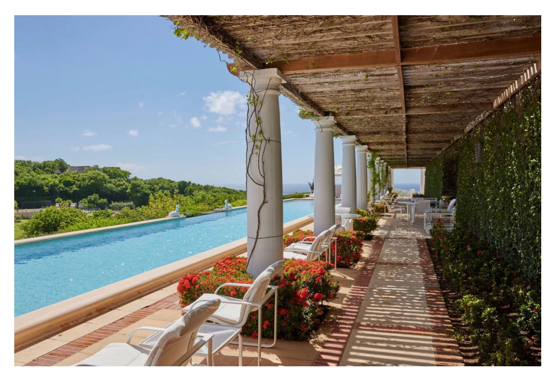
The Mustique Company

In true Mustique style, The Terraces isn't just a villa, it's practically a palace – especially as it also comes with a team of 18 staff (including two butlers, three chefs and six housekeepers). It's no wonder this magnificent island is a celebrity hotspot.