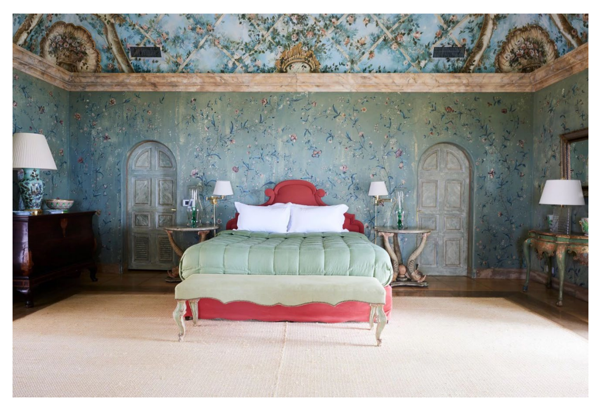
The Mustique Company

Of course, every holiday home needs a pool, and this one is rather spectacular: expect an enormous infinity pool commanding gorgeous sea views. Nearby, there's a separate building containing a whole host of amenities including a cinema, games room and pool table (and another swimming pool for good measure). The estate also features a tennis court and a collection of guest cottages providing four further bedroom suites and a third pool.