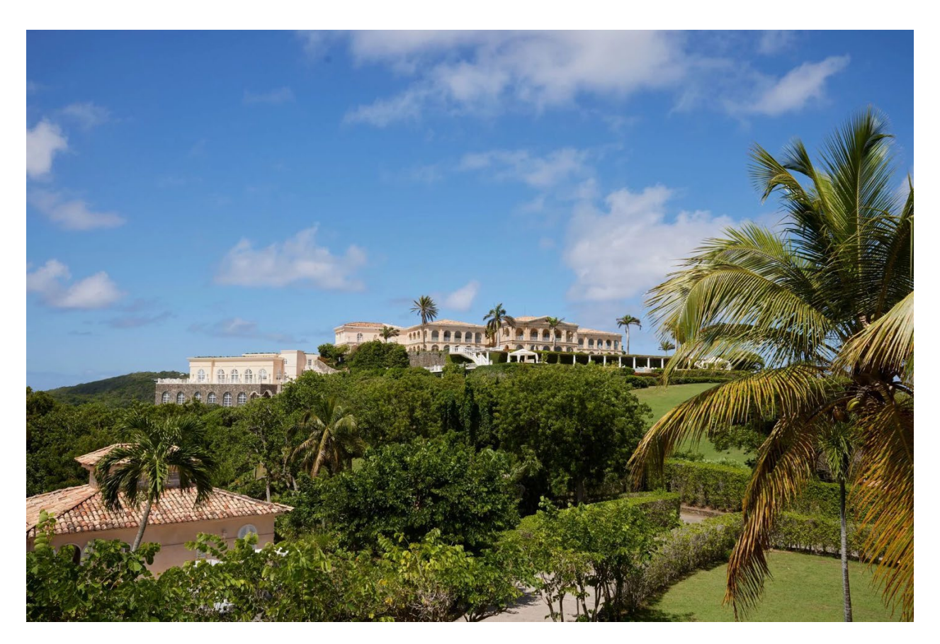
The Mustique Company

The only thing better than a luxury <u>holiday home</u> is a luxury holiday home in the Caribbean – and this one just happens to be located on the breathtaking island of Mustique, a vacation spot beloved by rockstars and royals alike.